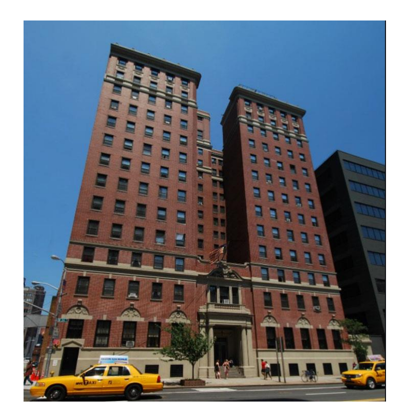
The Webster - Home of TRC's Residency Program, opening January 1, 2022